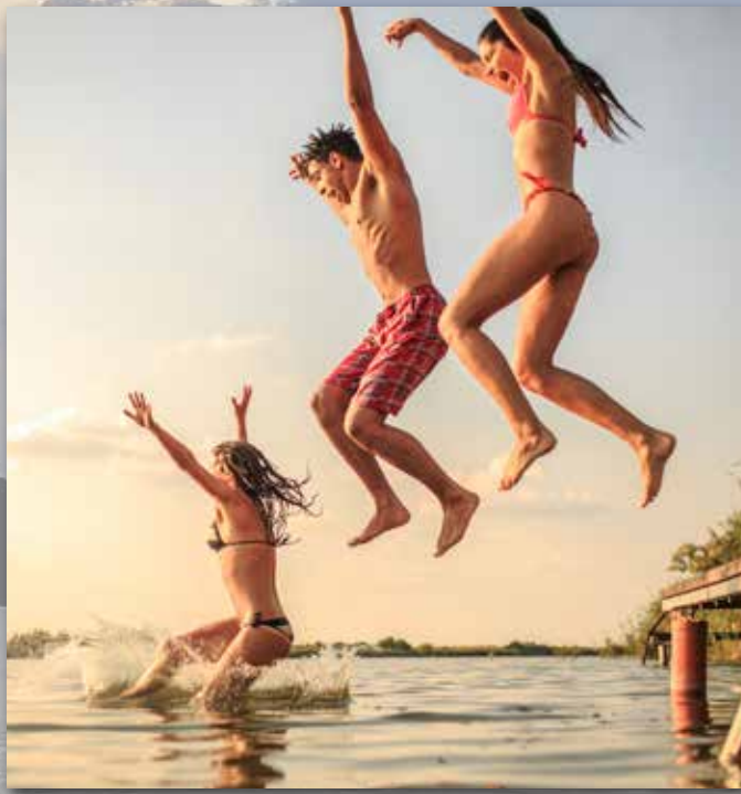
Enjoy lake life to the fullest at our Hideaway Ridge Development!

Hideaway Ridge is only 10 minutes from the Barren River State Park, and 20 minutes from Glasgow, KY with nearby access to great shopping and quality medical facilities. Entertainment options with Mammoth Cave & Bowling Green, KY are a short drive away.