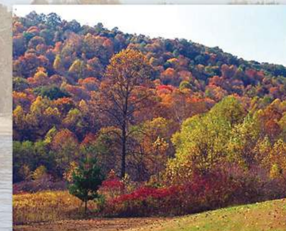
The wooded lots at Cedar Ridge Bay allow you to enjoy the beauty of the fall colors. They also give you the privacy that you desire for your weekend or retirement home.

BARREN RIVER LAKE'S MOST PRESTIGIOUS LAKE FRONT DEVELOPMENT