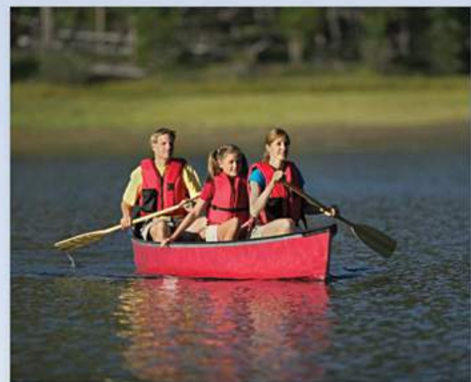
Barren River is an excellent place for float trips in canoes, or kayaks to enjoy the great outdoors.