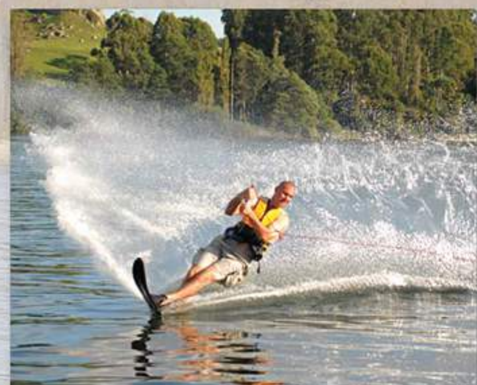
Barren River Lake is an excellent area for power boating, jet skiing, swimming and other water sports.

Cedar Ridge Bay is only one minute from the Barren River State Park, and 10 minutes from Glasgow, KY with nearby access to great shopping and quality medical facilities. This area has a nearly perfect climate and temperature. It stays cool in the summer and mild in the winter. An added attraction is the low cost of living.